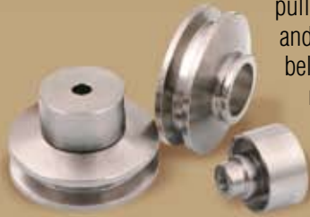
Double sealed pulleys

From the ground up the Hamer Model 2090 has been designed to improve uptime and production throughput. From the new main belt path to bag size changes, operator interaction has been significantly reduced. Our exclusive double sealed, self-cleaning pulley design requires no adjustment and keeps contaminants away from the belt path bearings. Combining these next-generation design enhancements with a 50% reduction in wear parts, heavy duty air cylinders and an all new fill opening design, the Model 2090 brings industrial plant bagging automation into the 21st century.