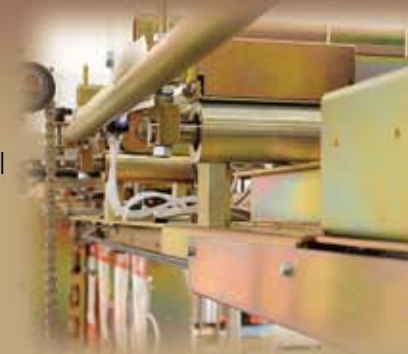
Model 2090 bag top sealer

Hot air sealing of bag tops has many benefits in industrial bagging. Fewer wear parts and efficient sealing (even with high dust products) are just a few. The new heat sealer design in the Model 2090 incorporates all we've learned in over 25 years of HFFS design. Double sealed bearings, reduced wear parts and a self opening feature opens the heat sealer when no bag is present. It automatically closes and is ready to seal the moment a bag is presented. By opening the sealer, pressure is removed from belts, pulleys and bearings, significantly increasing component life and reducing down time for maintenance. An optional bag jam detector can be added to stop a bag that is too full.