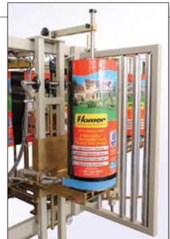
Second vertical roll holder option