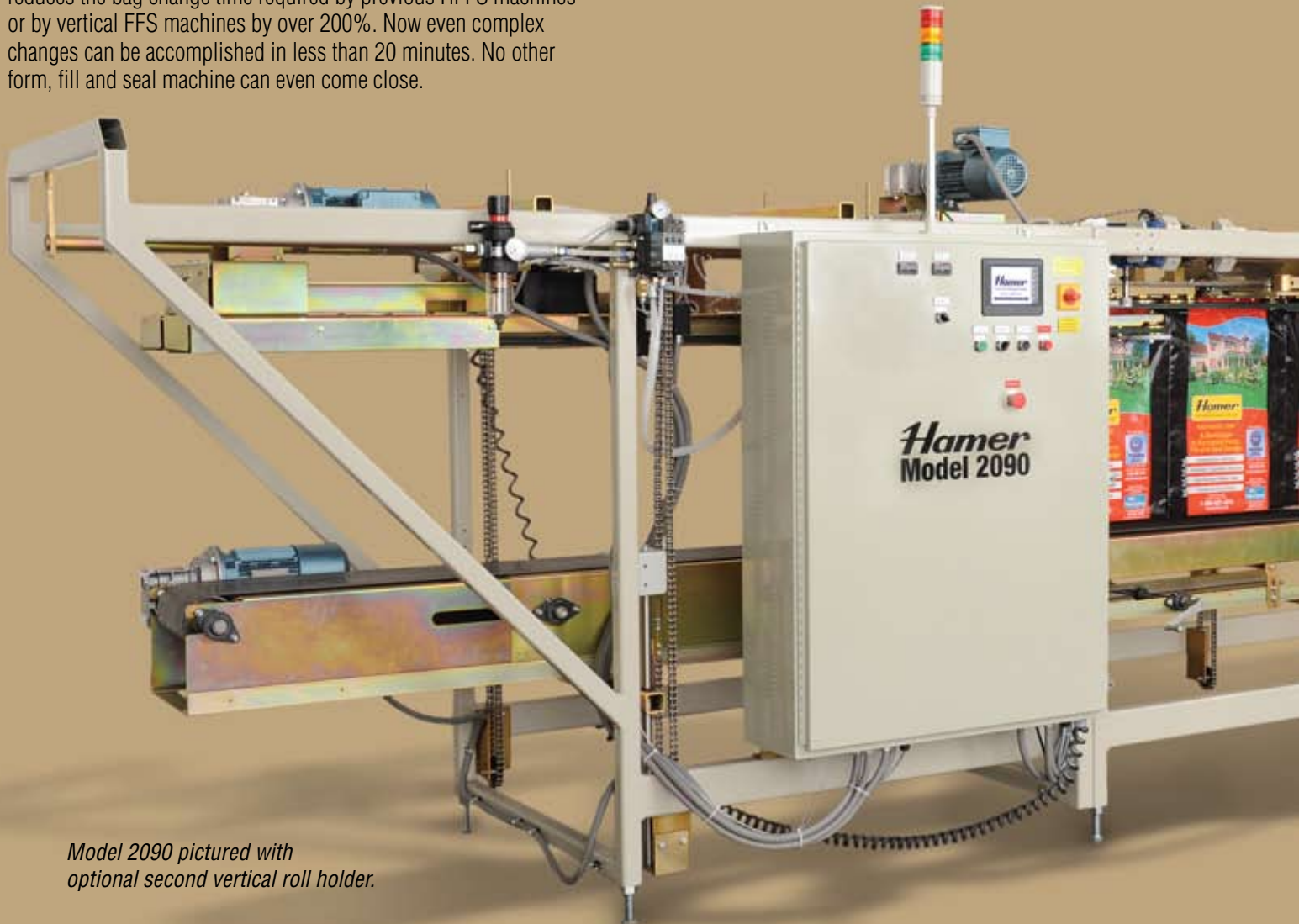
Model 2090 pictured with optional second vertical roll holder.