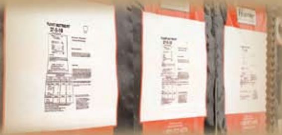
On-demand thermal transfer printing

Built with a modular frame, the 2090 is the most flexible large bag packaging machine available today. A wide range of bag and machine options can be added during initial machine build or after installation as field add-ons. From date coding to on-demand printing or reclosable zippers to bag handles, now you can get custom bag features and the cost-saving benefits provided by bagging automation.